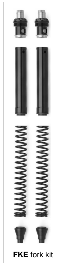
FKE fork kit