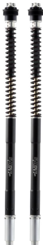
F25R fork kit quad-valve asymmetric system