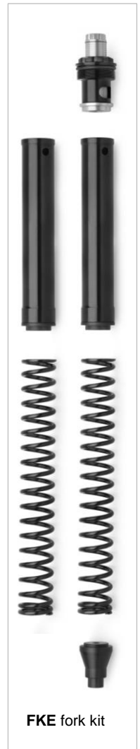
FKE fork kit