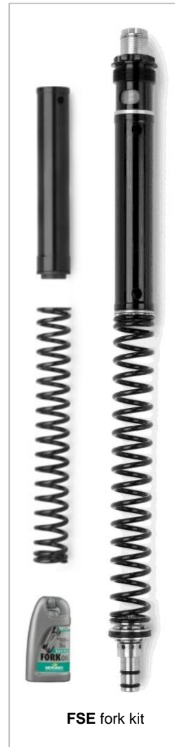
FSE fork kit