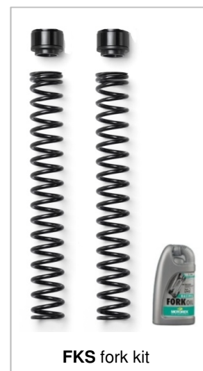
FKS fork kit