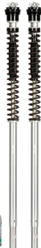
F20K fork kit