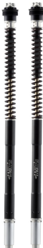
F25R fork kit