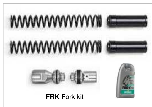
FRK Fork kit