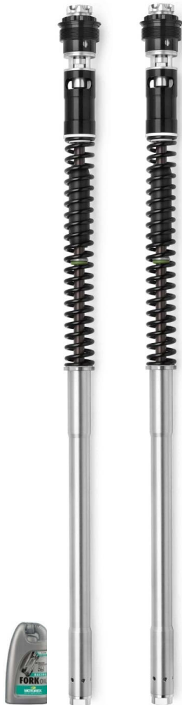
F20K fork kit