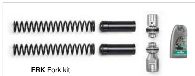
FRK Fork kit