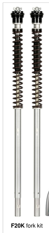
F20K fork kit