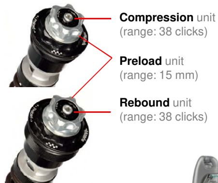
F20K fork kit