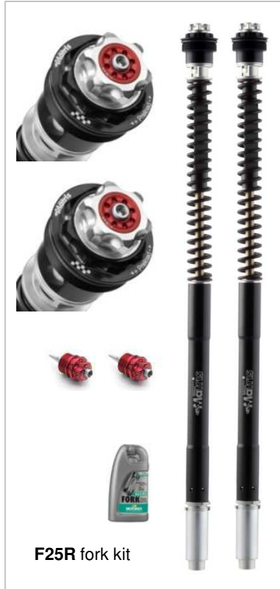
F25R fork kit