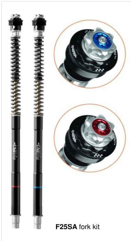
F25SA fork kit