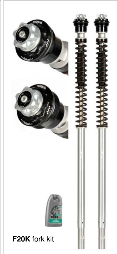
F20K fork kit