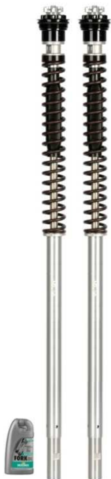
F20K fork kit