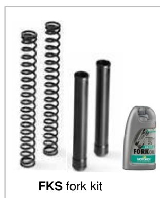
FKS fork kit