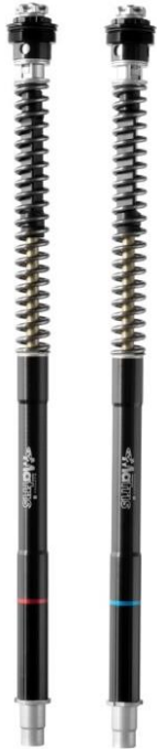
F25SA fork kit sealed asymmetric system