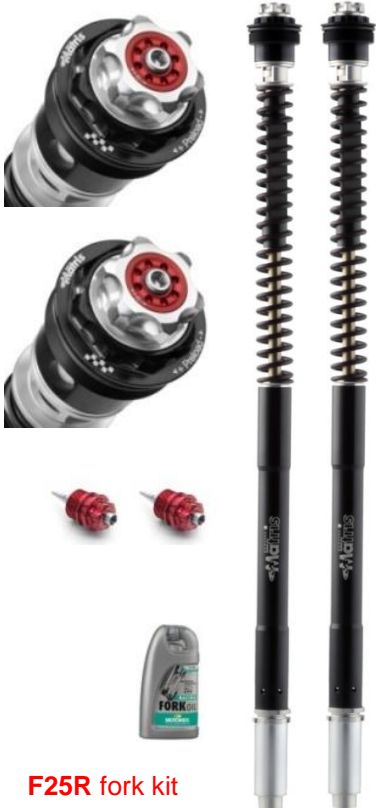
F25R fork kit