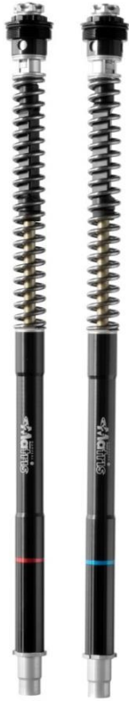
F25SA fork kit