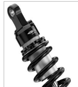
on demand Dark Series