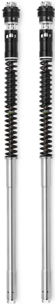
F20K fork kit