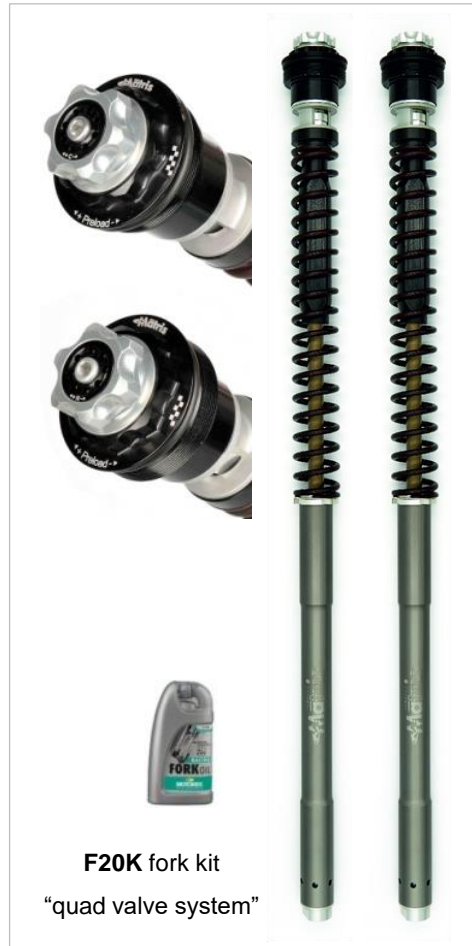
F20K fork kit "quad valve system"