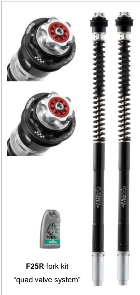
F25R fork kit "quad valve system"