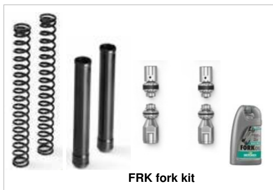
FRK fork kit