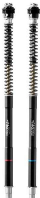
F25SA fork kit sealed asymmetric system