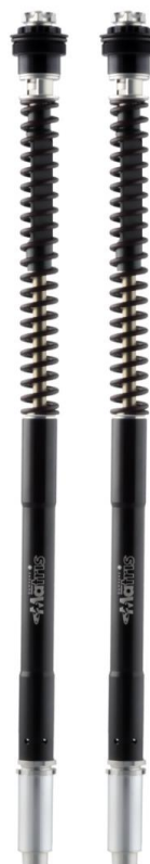
F25R fork kit quad-valve asymmetric system