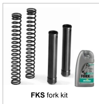
FKS fork kit