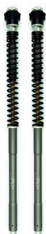
F20K fork kit quad-valve asymmetric system