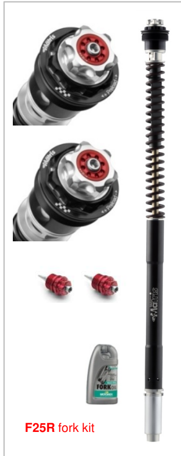
F25R fork kit