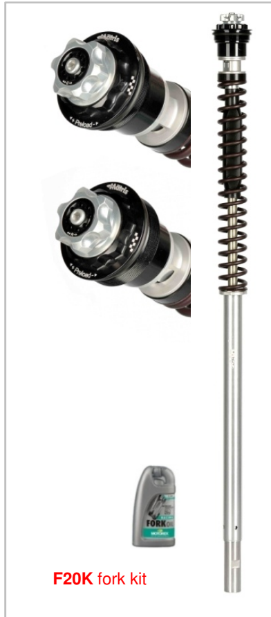
F20K fork kit