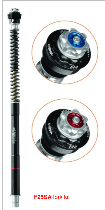
F25SA fork kit