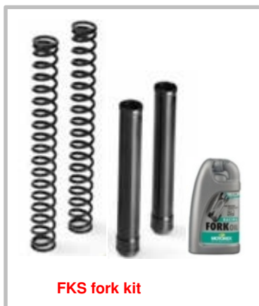
FKS fork kit