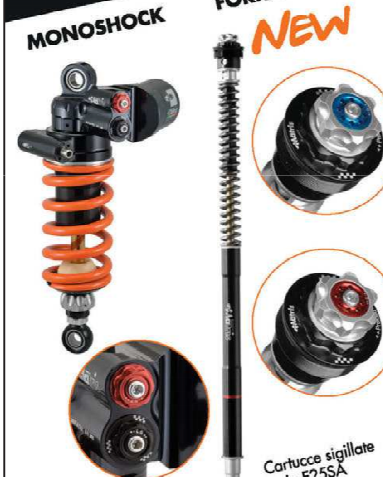
M46 serie R Cartucce sigillate serie F25SA