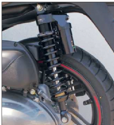
Honda SH 300