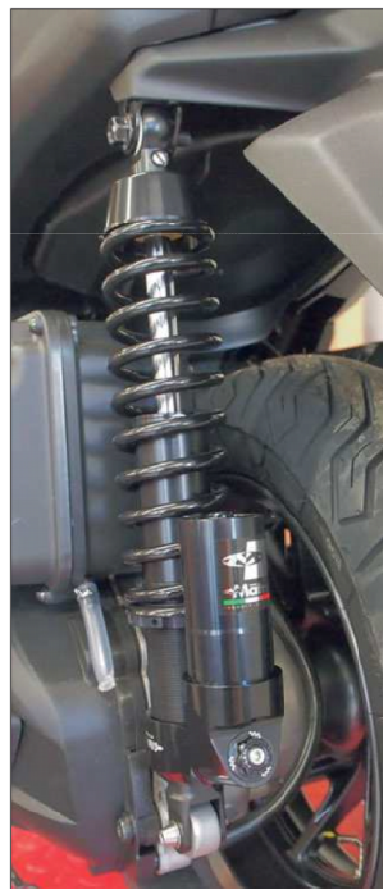
Yamaha XMax 400