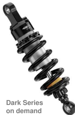
Dark Series on demand