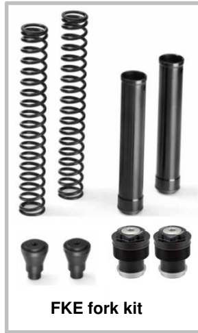
FKE fork kit