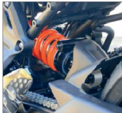
Rear shock for Tracer 700