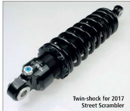
Twin-shock for 2017 Street Scrambler

well as a "price point" FKE fork spring kit, all ready to fit without any modification to the original fork. Also available are adjustable and "speed sensitive" steering damper kits (SDK & SDR) for sport riders, to reduce shaking and provide greater safety at high speed, and an IKS knob-hydraulic spring preload to fit and upgrade the OEM rear shock.