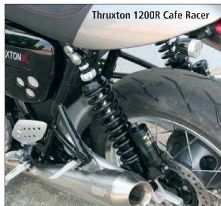
Thruxton 1200R Cafe Racer