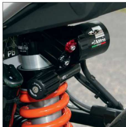
BMW R nineT 1200 Scrambler Racer

Finally, for the "timeless and legendary" 2016 Thruxton 1200R Cafe Racer, Matris has added model-specific products to customise and improve